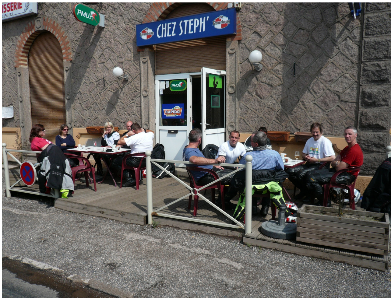
Club members on the Germany Tour